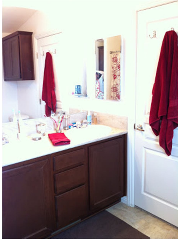
(add medicine cabinet and cupboard over toilet)