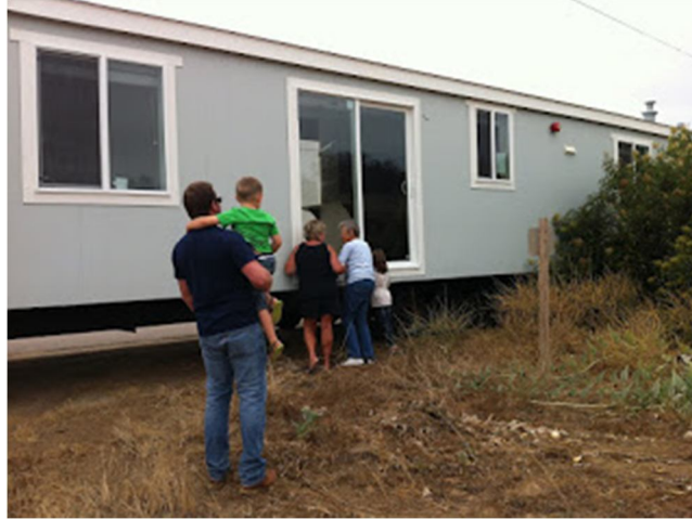
Gramma came along and spent the day with us, too. They are looking in at the dining room.