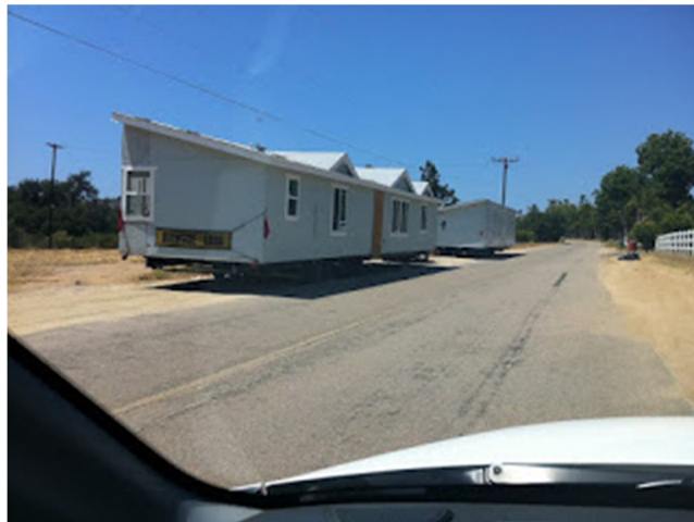
Around 1:30 the transporter called us and we went back over to see the rest of it. This is our first look at both pieces.