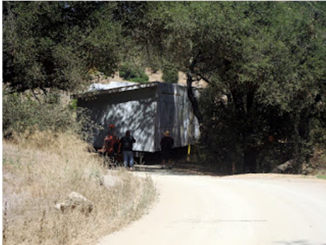
Winding through the oak trees.