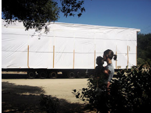
Mommy and Jake watching our house go by!