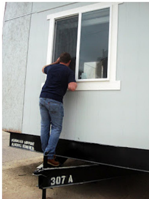
Looking in the baby's room.