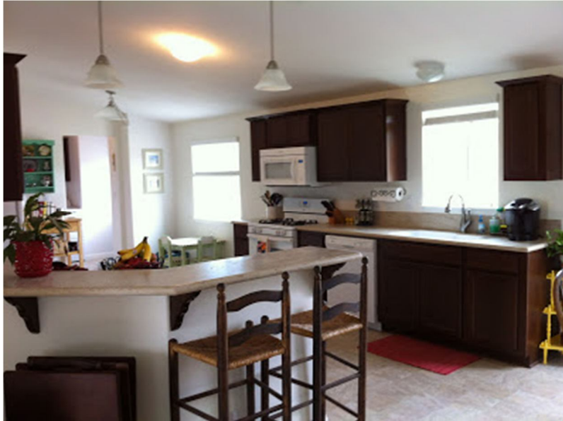
Snack bar from the Living Room

*Corian countertops in 'Tumbleweed' with upgraded sink/faucet*