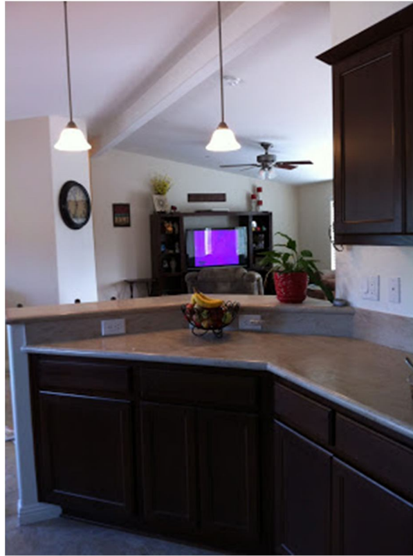
Snack bar looking through to the Living Room (added ceiling fan)