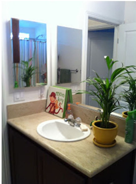
Guest Bathroom (add medicine cabinet)