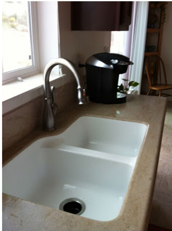
I love this sink!