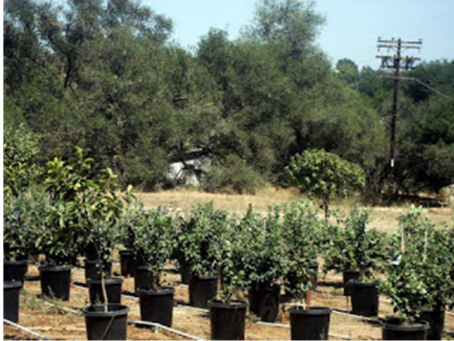
Here it comes!