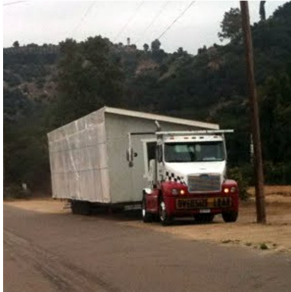
This was our first look at it. It is parked out on Ranger Road.

Our house is here! The delivery was scheduled for between 10 and 12 this morning (well, it was originally scheduled for last week, but there was a mix-up at the factory). We were all over at the office waiting and around 11, the first half arrived.