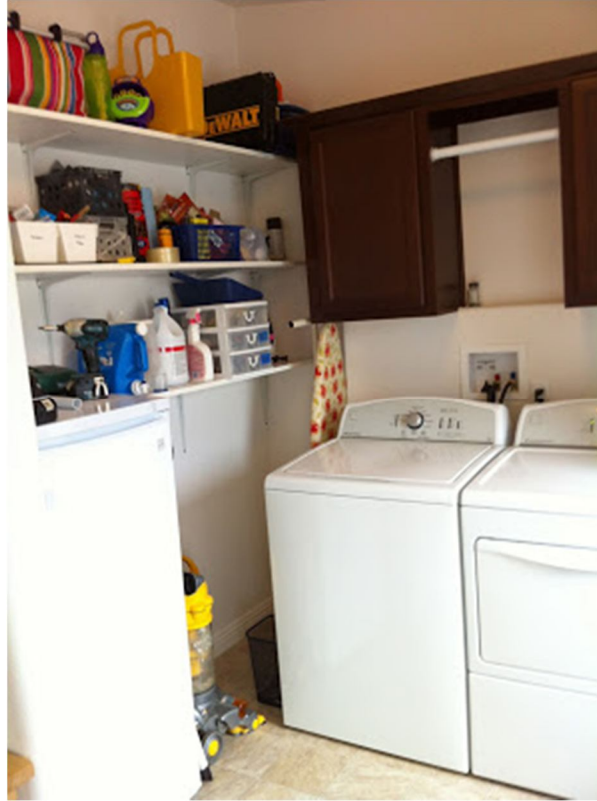
Laundry Room (Christian added shelves and there was plenty of room for an extra freezer)