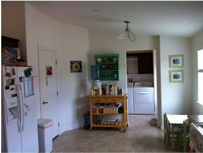
Looking through kitchen/breakfast nook to laundry room

My lovely, spacious kitchen! **Veranda' cabinets with 'Brandy' finish* (added appliance package)