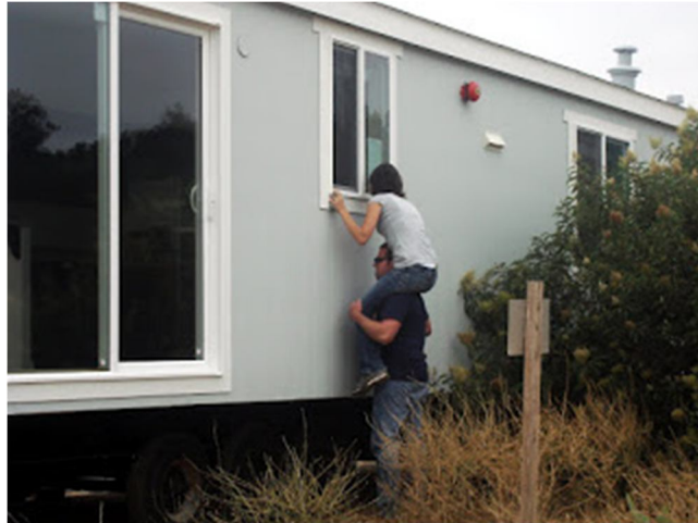
But first we peeked in the windows. Here I am admiring my new kitchen!