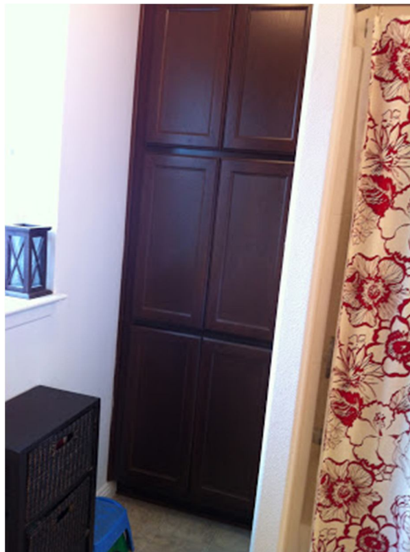
Added linen closet in Master Bathroom -- SOO glad we did this!