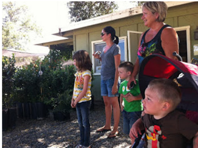
So cool to watch!